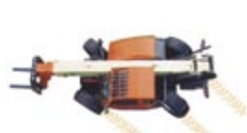
Crab steer for sideways movement and precise positioning before lifting