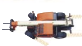
Front wheel steer when driving on the road

Compact dimensions, four-wheel drive, and three different steering modes help make these machines highly maneuverable for working in and around buildings and other confined work areas. Plus, with a powerful 100 hp Deutz turbo-diesel engine and two-speed hydrostatic transmission they can handle rough terrain.