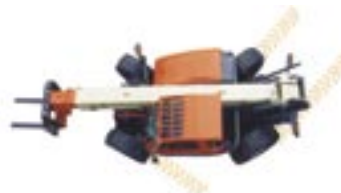
All-wheel steer to help reduce the turning radius in confined areas